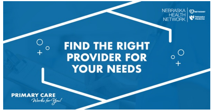
Caption: Our clinic includes more than (# of providers at clinic) primary care providers to choose from. Confidently pick a provider by reviewing the benefits with resources from the Nebraska Health Network. https://nebraskahealthnetwork.com/primarycare/ #PrimaryCareWorksForYou