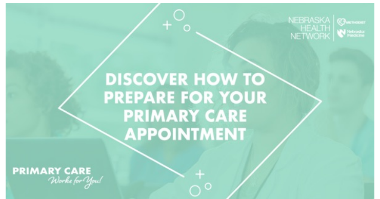
Caption: Not sure what to expect during a primary care appointment? Learn more about how to prepare, what to expect during the appointment and how to make the most out of the time with your care team. Download the Nebraska Health Network's overview and Appointment Planning Guide at https://nebraskahealthnetwork.com/primarycare/ today. #KnowBeforeYouGo #PrimaryCareWorksForYou